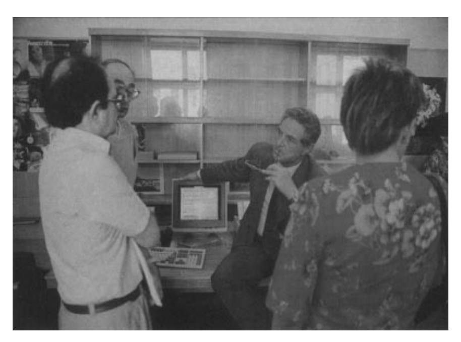
As part of the Soros Foundation aid efforts, computers have been donated to high schools in Eastern Europe.