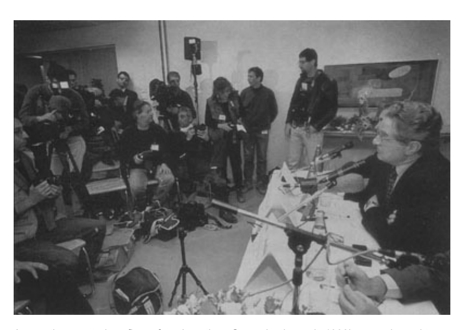
A secretive, mysterious figure for a long time. Soros, by the early 1990's, was pleased to appear at press conferences as a way of promoting his philanthropic activities.