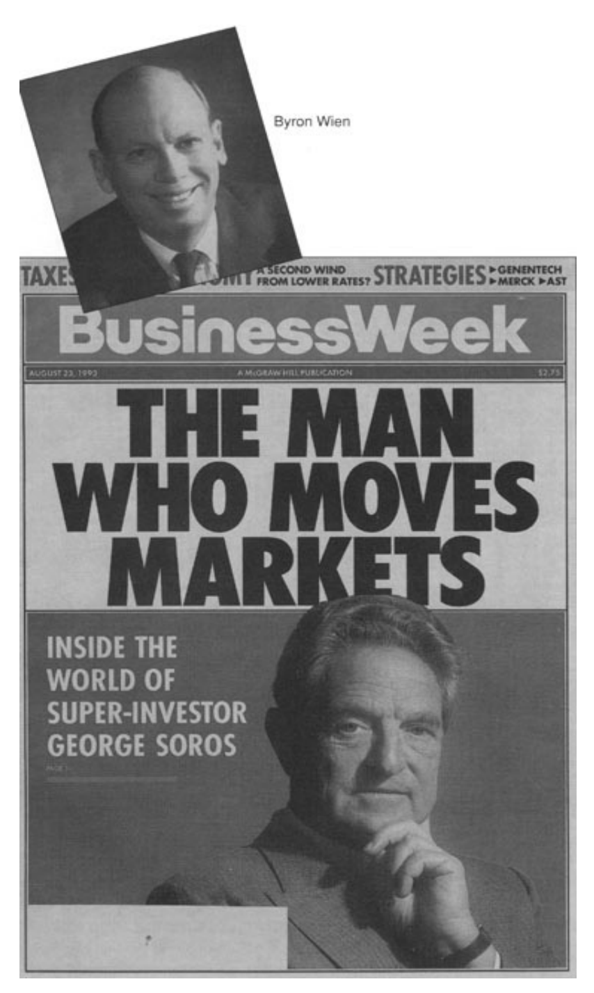
Stories like this one gave Soros the reputation of someone with vast powers over the financial market